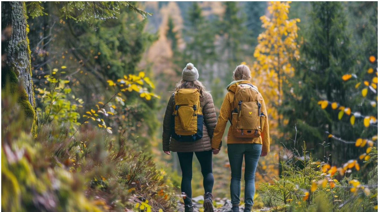
The most beautiful place for couple adventure vacation

Overall, a couple adventure vacation offers numerous advantages, from strengthening the bond between partners to fostering personal growth and creating cherished memories that last a lifetime.